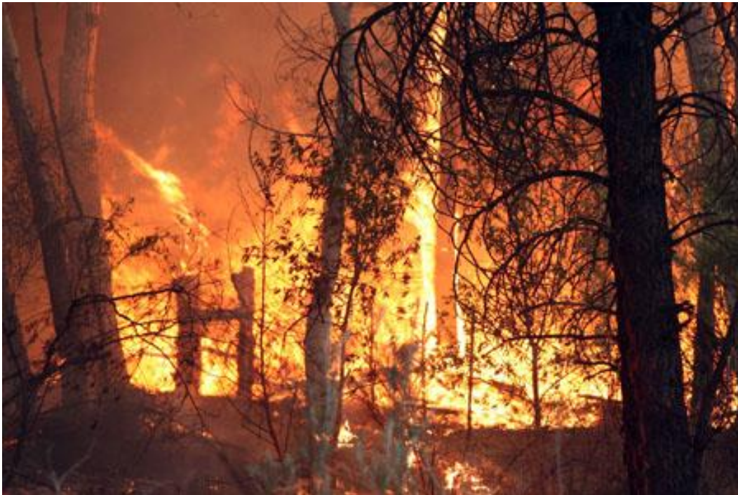
Skates Fire, June 2006