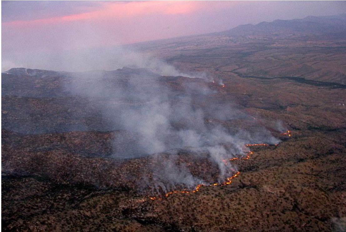
Distillery Fire

People and organizations frequently, mistakenly believe that their objective is to “become a HRO,” as if it were a certification. However, in reality, organizations cannot bank high performance or high reliability. Organizations achieving high reliability know that they must become a learning organization committed to continuously learning and improving performance.