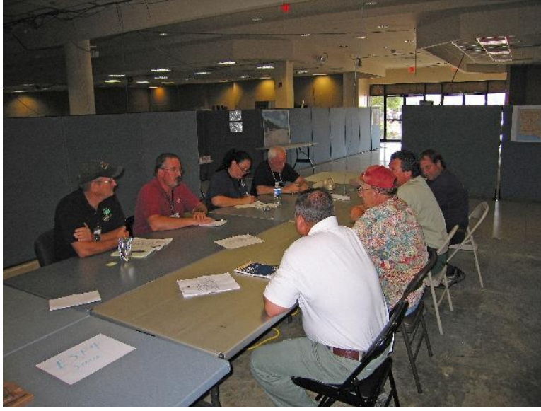
Mid-Incident Review with Planning Cell, Hurricane Gustav

Daily “stand up (morning) and fall down (evening)” meetings brought the team together for a brief time on a regular basis, sometimes to do a “Chainsaw AAR.” A “Mid-Incident Review” gave the expanded ESF #4 Planning Section Cell working with FEMA’s planners an additional opportunity to “learn while doing” at a logical break in their week. This review enabled the Planning Section Cell to immediately implement changes based on lessons learned during the earlier part of the assignment while they were still fresh in their minds. This was also beneficial during the After Action Review at the end of the NIMO’s assignment. Making time to learn in